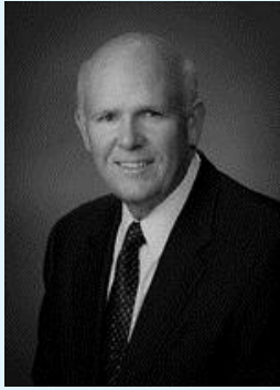
Daniel F. Akerson