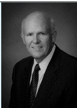
Daniel F. Akerson